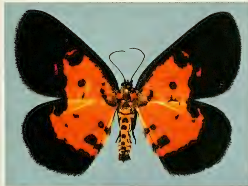
Fig. 9. Inouea colini , spec. nov., Paratype, ♂, Negros.

to costa and terminal fascia. Spot below cell round, smaller than in I. hiroshii , at more distal position. Antemedial line reduced to oblique streak at the inner margin of the wing basis. Hindwing with broad terminal fascia, though